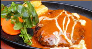
Demi-glace hamburger steak