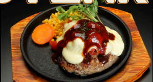
Cheese and tomato hamburger

LAKE YAMANAKA HAMBURGER STEAK BIG 500g ¥3,179